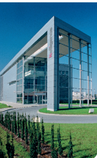
The itelligence-data center in Poznan, Poland.

The demands on your SAP systems are high. You can only achieve guaranteed availability, high flexibility and protection from intruders by building up and maintaining a corresponding infrastructure and with a great deal of know-how. This continually ties up personnel and material resources, which are then no longer available to take care of your company's actual business processes. Why are you still operating your SAP landscape yourself?